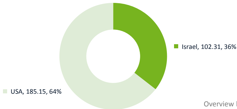
Overview by Jurisdiction